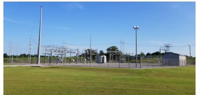
Union City Electric Authority's substation adjacent to site