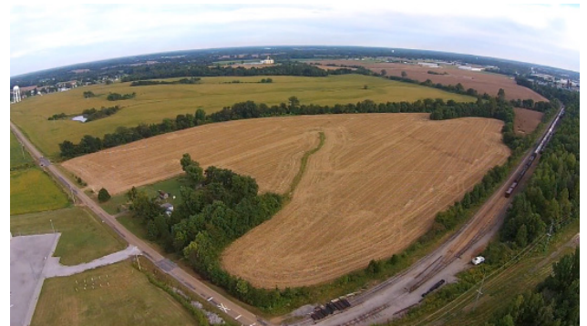
Looking Southeast across the site