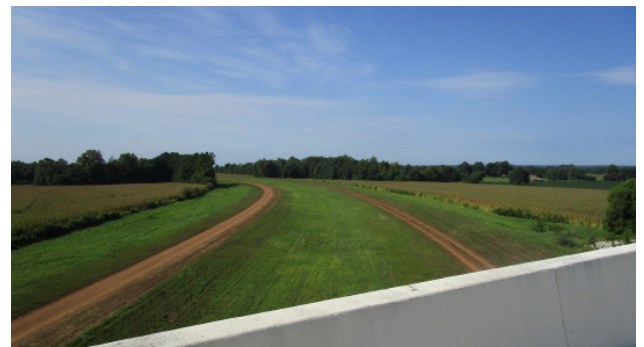
Future Interstate 69 right-of-way